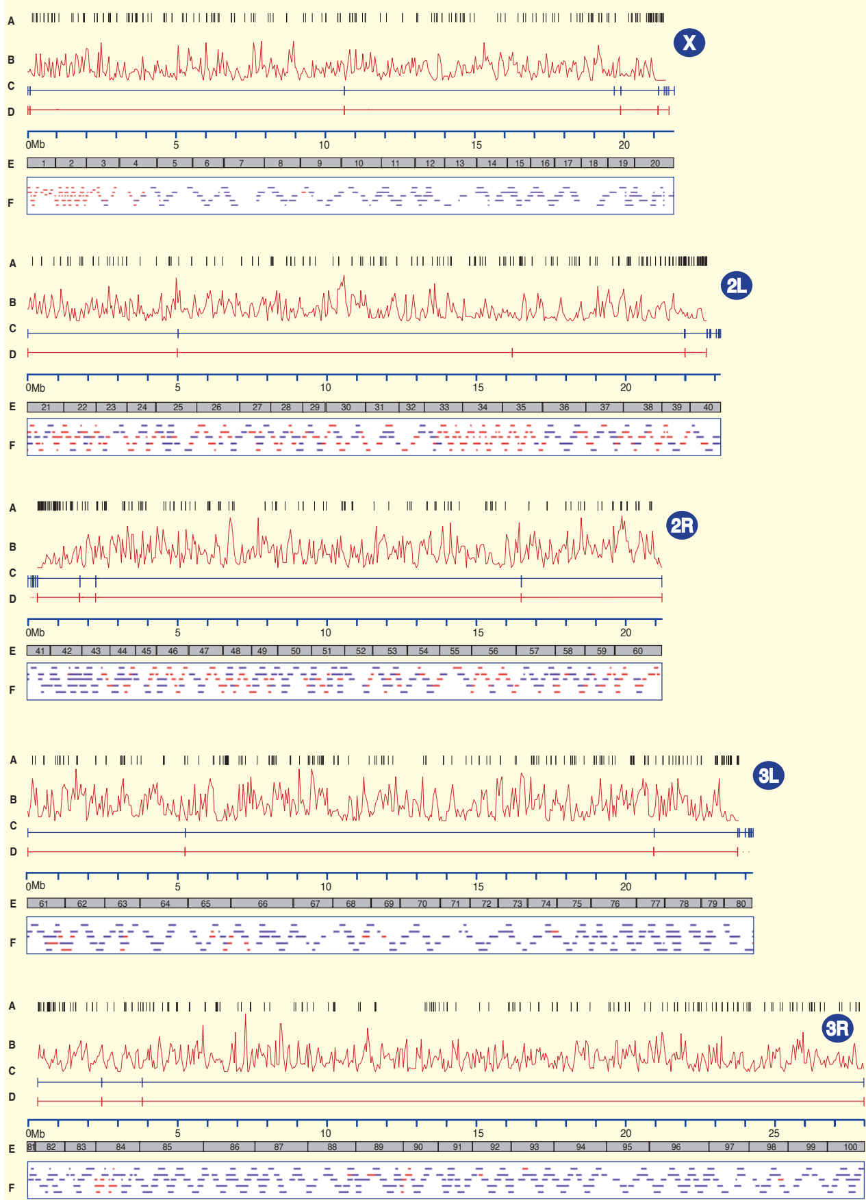
Fig. 3. Assembly status of the Drosophila genome. Each chromosome arm is depicted with information on content and assembly status: (A) transposable elements, (B) gene density, (C) scaffolds from the joint assembly, (D) scaffolds from the WGS-only assembly, (E) polytene chromosome divisions, and (F) clone-based tiling path. Gene density is plotted in 50-kb windows; the scale is from 0 to 30 genes per 50 kb. Gaps between scaffolds are

represented by vertical bars in (C) and (D). Clones colored red in the tiling path have been completely sequenced; clones colored blue have been draft-sequenced. Gaps shown in the tiling path do not necessarily mean that a clone does not exist at that position, only that it has not been sequenced. Each chromosome arm is oriented left to right, such that the centromere is located at the right side of X, 2L, and 3L and the left side of 2R and 3R.